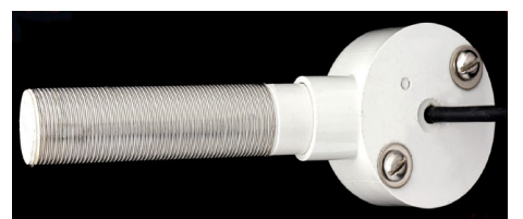
Cylindrical wetness sensor